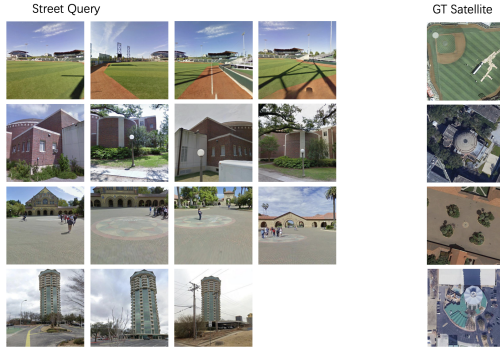
Figure 3: Samples for Street2Satellite in Our Challenge.